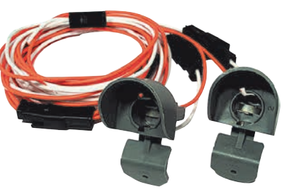
500081 Courtesy Kit

This 429 piece weather pack kit provides you with plenty of connection options that will help you with troubleshooting, repairing, or replacing connections. All contents are compartmentalized in a durable case with a heavy duty latching closure. The inside of the lid has a diagram detailing the contents by image and description.