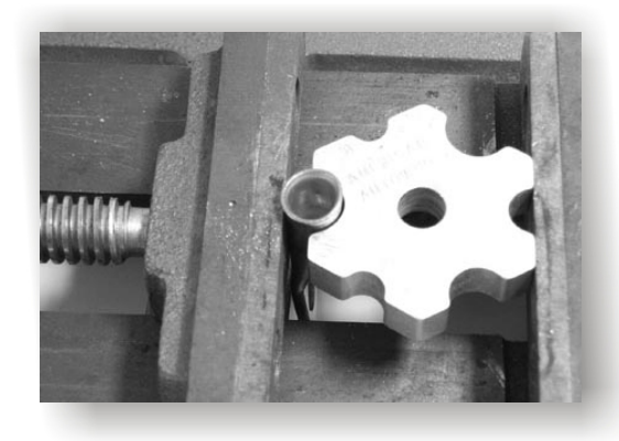
STEP 2: Set the crimp tool in a vise, as shown, with the terminal set into position.