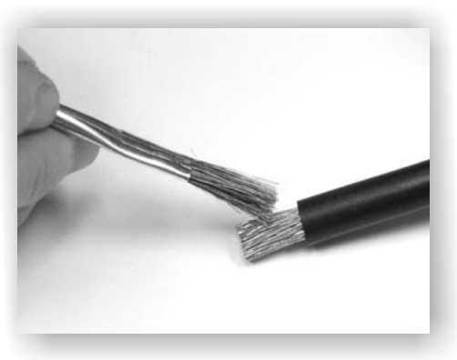
STEP 3: Strip the cable to 5/8", and apply rosin solder flux. A protective sleeve (shrink tube) should be slid onto the cable at this point if you are using one.