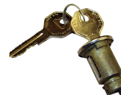
AAW P/N 500674 (smooth face):

500423 - 1955-56 Chevy car 500434 - 1957 Chevy car 500481 - 1955-59 Chevy Truck 510217 - 1959-60 Chevy Impala 510063 - 1961-64 Chevy Impala 510267 - 1953-62 Chevy Corvette