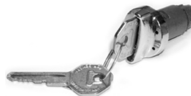
AAW P/N 500672 (with finger guard):

NOTE: AAW has new lock cylinders with the correct GM style keys for your new 500684 ignition switch. Check below for your vehicle's correct application.