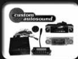
CUSTOM AUTOSOUND AUDIO SYSTEMS!