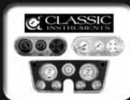
CLASSIC INSTRUMENTS GAUGES!