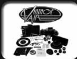
VINTAGE AIR GEN IV SURE FIT KITS!