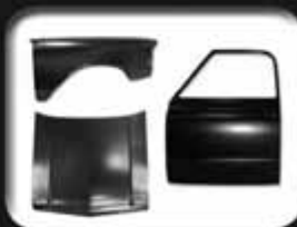
SHEET METAL BODY PANELS!