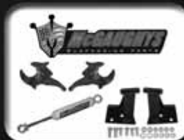
MCGAUGHY'S SUSPENSIONS PARTS!