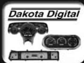
DAKOTA DIGITAL GAUGES!

*Please specify which catalog when ordering. One free catalog per person for US residents. $8.00 postage for international customers.